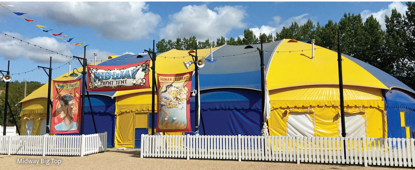
Midway Big Top