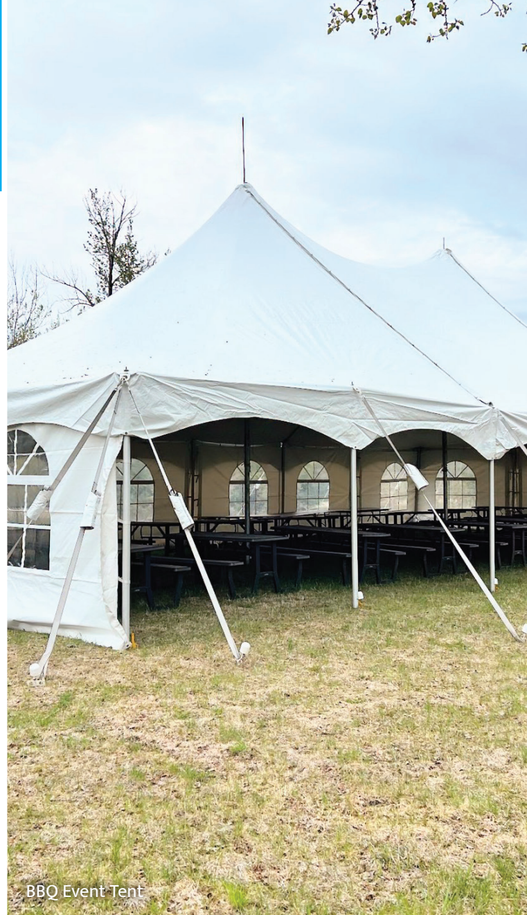
BBQ Event Tent

Book your event at the Midway Big Top, located on the newly re-imagined 1920s Midway at Fort Edmonton Park! Inches away from amazing attractions such as our iconic Carousel and soaring 56ft Ferris Wheel, the Midway Big Top is perfect for unique corporate and social gatherings!